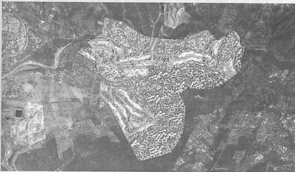
Figure 1. The golf course superimposed on the study area