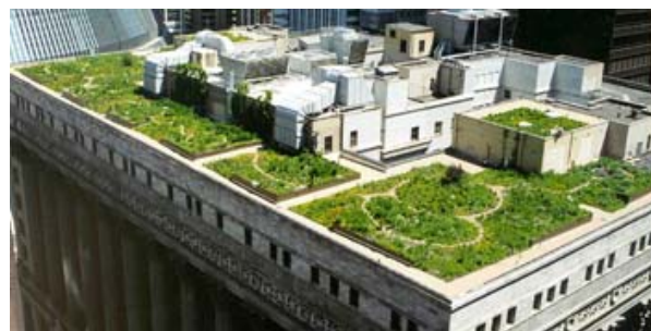
Figure 3 – The City Hall rooftop garden sits atop Chicago's City Hall.

Roof gardens, the precursors of contemporary green roofs, have ancient roots. The earliest documented roof gardens were the hanging gardens of Mesopotamia, considered one of the seven wonders of the ancient world (Oberndorfer et al., 2007). Green-roof habitats contribute to local biodiversity conservation and provide aesthetic and psychological benefits for people in urban areas. Even when green roofs are only accessible as visual relief, they contribute to stress relief (Hartig et al., 1991). Other services of green roofs include urban agriculture (food production can provide economic and educational benefits) and sound pollution reduction (Dunnett and Kingsbury 2004).